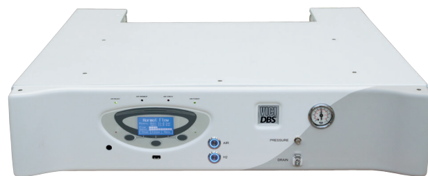
FID Flat Version for placement under GC