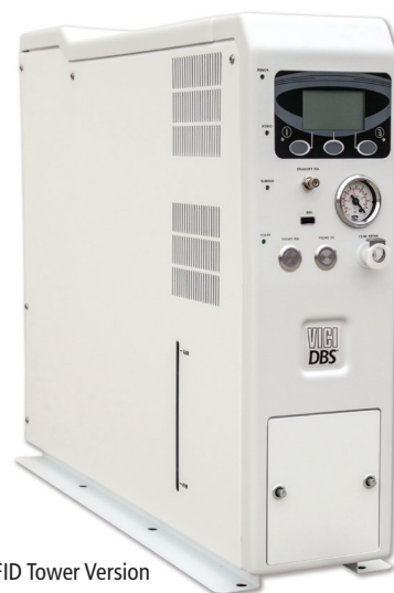
FID Tower Version